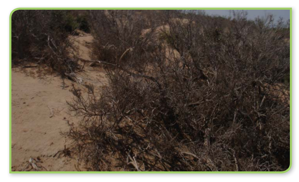
Fig. 5: Dead Sueada Friticosa in Bulahar area