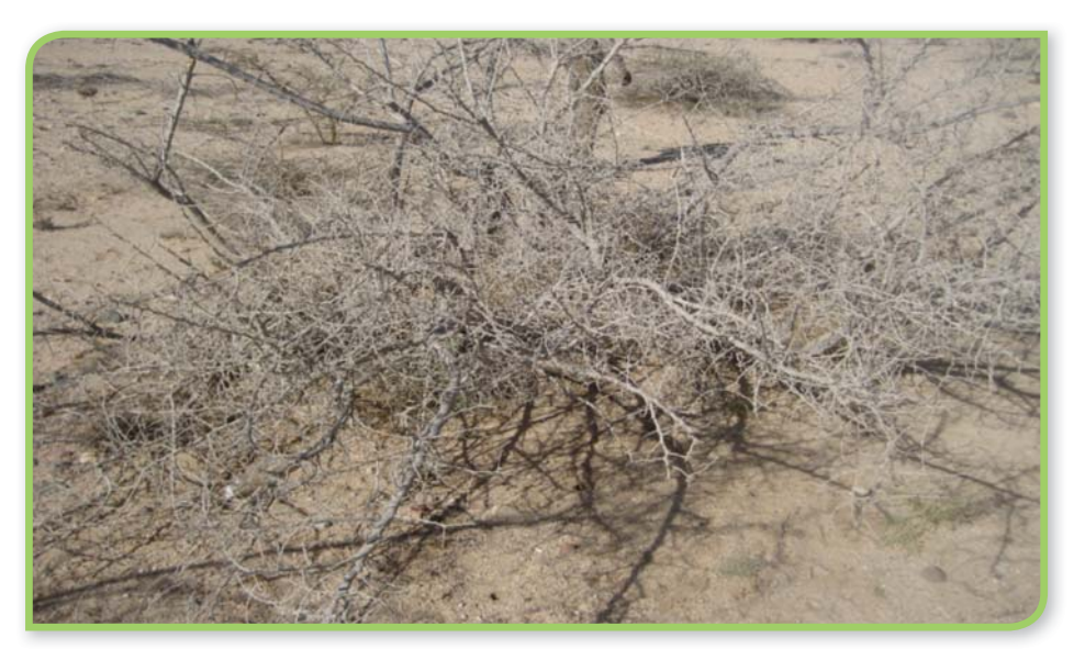
Fig. 3: Young dead Zizyphus hamur. Most of trees in the background are also dead, (Jiifto area)