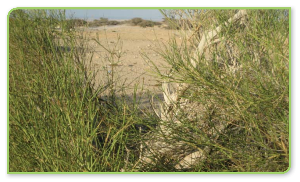
Fig. 7: Leptadenia spartium ('Moroh', north of Xabaalo Tumaalo