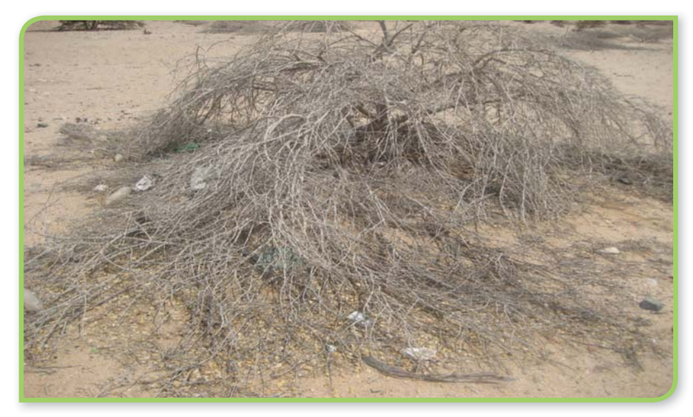
Fig. 1: Dead Acacia tortilis, Jiifto hill (11.4 km south of Berbera)