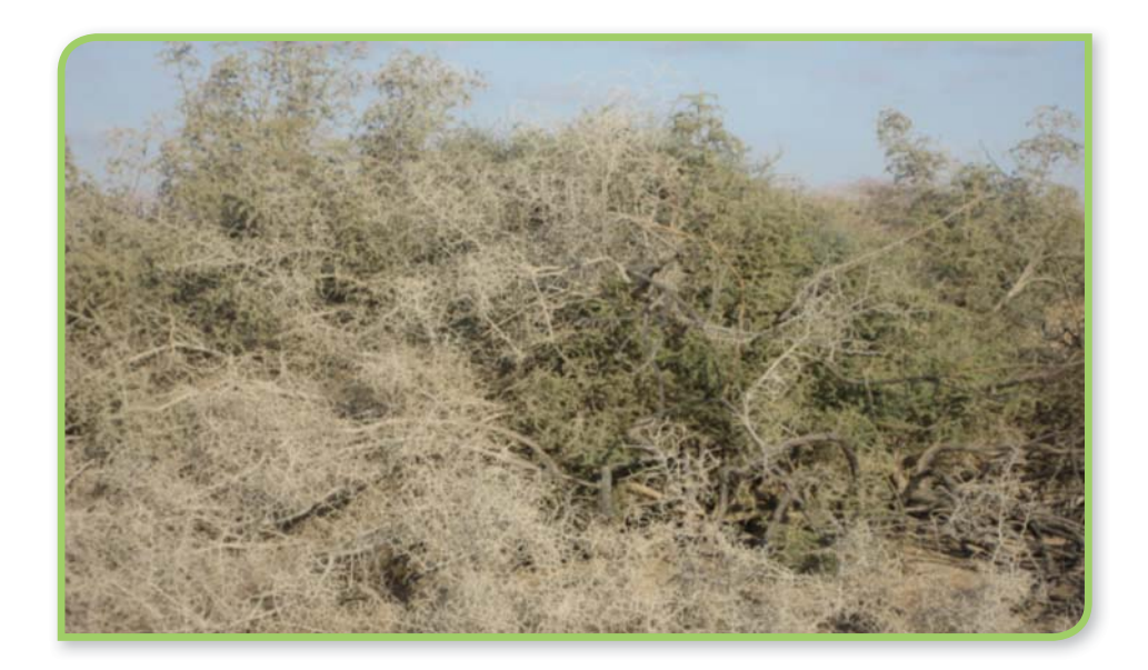
Fig. 2: Zizyphus hamur near Jiifto Hill, south of Berbera in the process of drying out