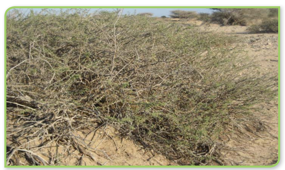
Fig. 6: Acacia edgeworthii ('Jerin'), South of Jiifto Hill, not much affected