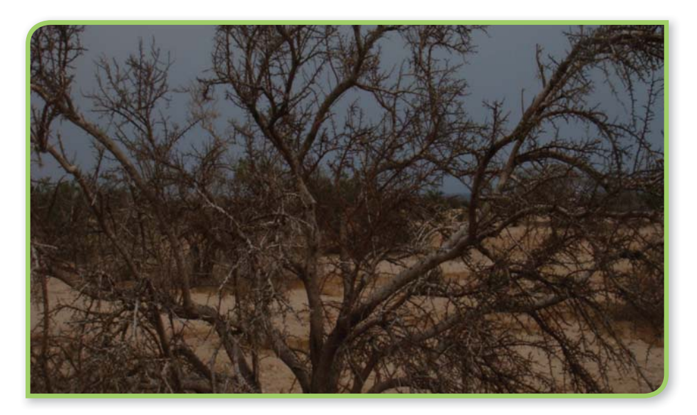
Fig. 4: A dead Balanities in Abdi-Geeddi area, Lughaya District