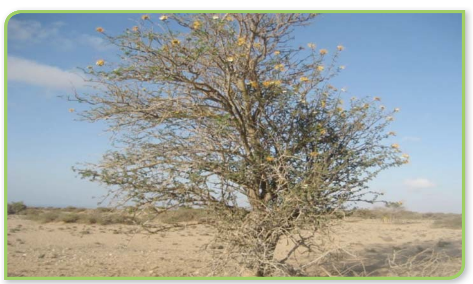
Fig. 8: Lone Delonix elata ('Lebi') in the coastal area near Berbera

15 Perennial Plant Mortality in the Guban Areas of Somaliland